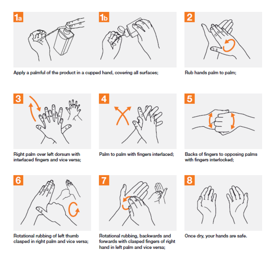
Figure 1 – Image from the World Health Organization (WHO)'s Hand Hygiene: Why, How and When? (WHO, 2009)

• Using Hand Sanitizer – Hand sanitizer contains alcohol and is a flammable liquid. Flammable liquids should be stored away from ignition sources. Follow the instructions on the label.